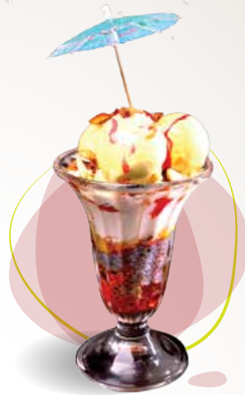
ARABIAN FALOODA ₹ 199