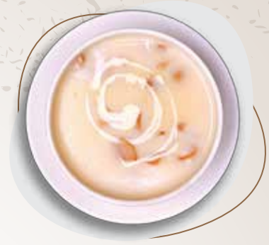
CREAM OF CHICKEN SOUP ₹ 139