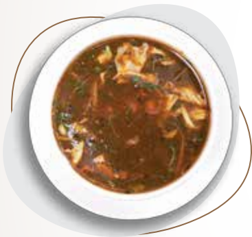
HOT AND SOUR SOUP (VEG ₹ 109 | CHICKEN ₹ 119)