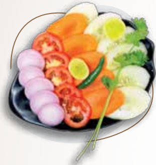
GREEN SALAD ₹ 90