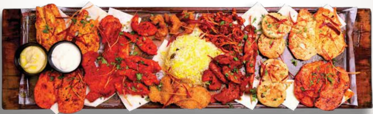
AHMEDIA SPECIAL PLATTER (FULL ₹ 1699) A

Delicious Arabian Mixed Non-Veg Starters is a Preparation in Tawa with Arabian Spices Dajaj Mashwi | Dajaj Faa | Effa Dajaj | Tawa Prawn Tawa Fish | Sqjud Tawa Fry | Clope Samak Makhli Laham Mashwi & Dajaj Tikki