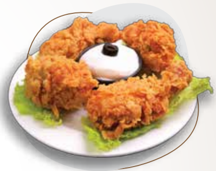
BROASTED STRIPS (4pcs ₹ 129 | 6pcs ₹ 199 8pcs ₹ 259)