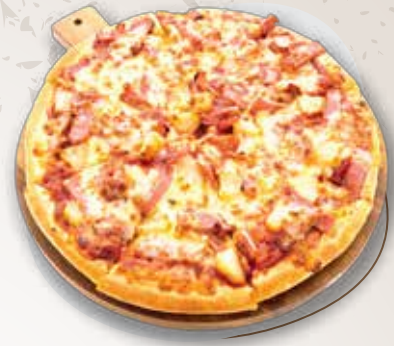
CHICKEN CHEESE PIZZA ₹ 199