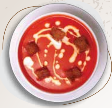
CREAM OF TOMATO SOUP ₹ 119