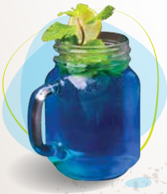
BLUEMINT MOJITO ₹ 139