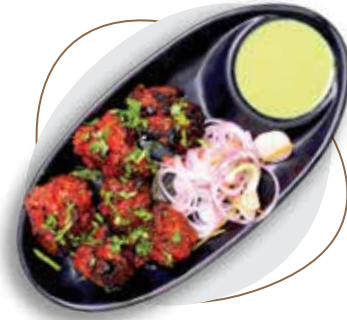
CHICKEN MASTANA KEBAB ₹ 259