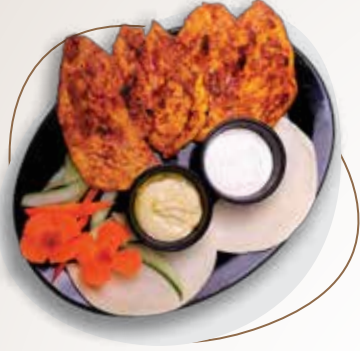
DAJAJ MASHWI ₹ 349