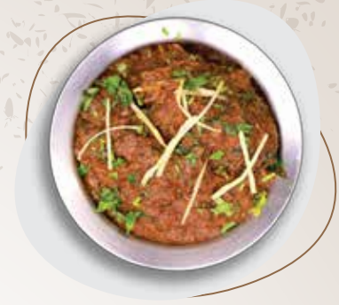
MURGH MUSSALAM (HALF ₹ 269 | FULL ₹ 599)