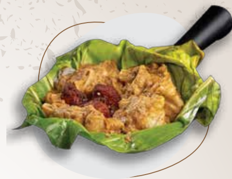
KIZHI PARATHA (NON VEG)CHICKEN ₹ 299