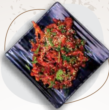
CHICKEN HONEY CHILLI (DRY) ₹ 269