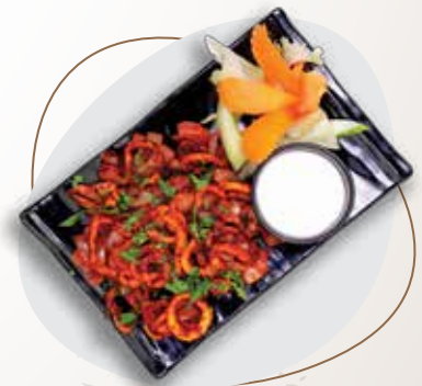
SQUID TAWA FRY ₹ 399