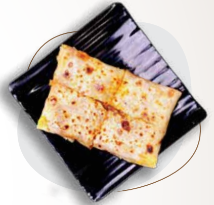
CEYLON KHEEMA CHICKEN PAROTTA ₹ 189