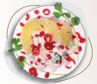
HAWAIIAN CHICKEN SALAD ₹ 149