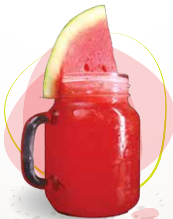
WATERMELON MOJITO ₹ 129