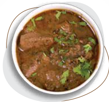
MUTTON LIVER FRY ₹ 199