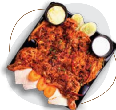
ALFAHAM B.B.Q (HALF ₹ 239 | FULL ₹ 449)