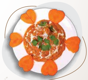
AHMEDIA SPECIAL CHICKEN A ₹ 259