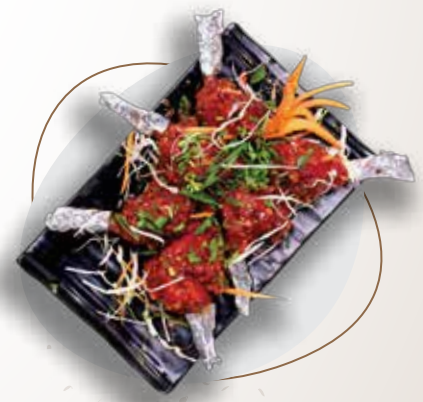
CHICKEN LOLLYPOP (SAUCY) ₹ 259