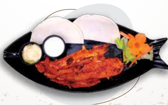
B.B.Q FISH BONELESS ₹ 389