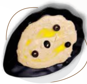
HUMMUS S ₹ 59 | M ₹ 105 | L ₹ 149