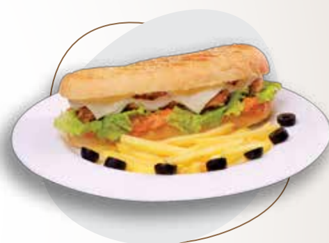
CRISPY CHICKEN SANDWICH ₹ 99