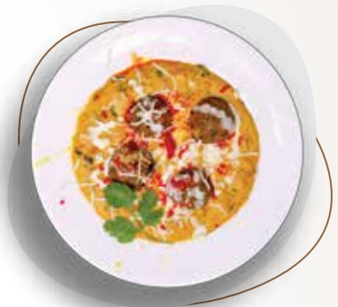
VEG KUFTA ₹ 189