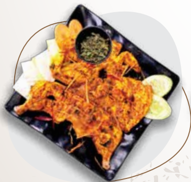
MOROCCAN B.B.Q (HALF ₹ 239 | FULL ₹ 449)