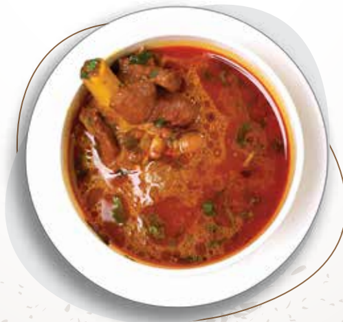
MUTTON NALLI SOUP A ₹ 179