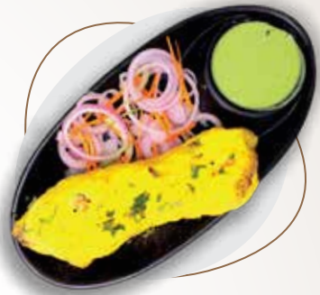
RESHMI KEBAB ₹ 259