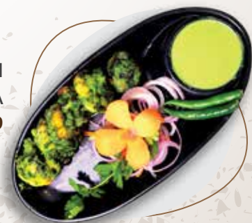
HARIYALI PRAWN TIKKA ₹ 439