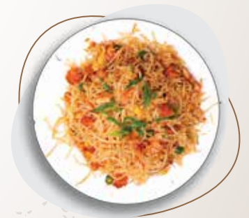
CHICKEN NOODLES ₹ 179