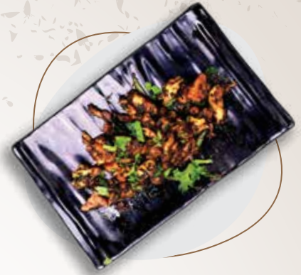
CHICKEN SUKKA ₹ 199