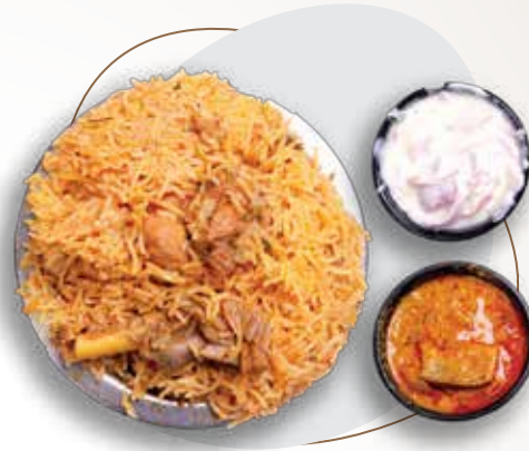
MUTTON BIRYANI ₹ 309