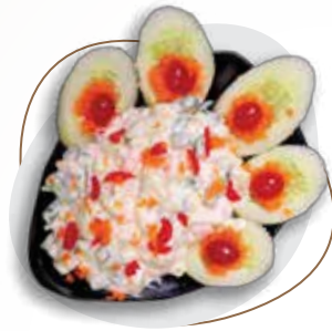
RUSSIAN SALAD ₹ 129