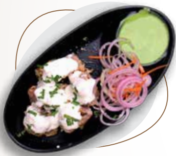
CHICKEN MALAI KEBAB ₹ 259