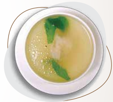
WONTON SOUP (VEG ₹ 109 | CHICKEN ₹ 119)