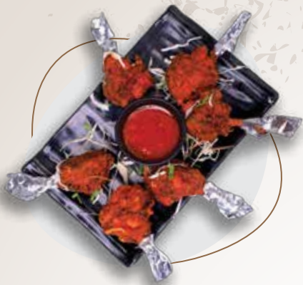
DRUMS OF HEAVEN (DRY) ₹ 259