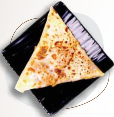
CEYLON KHEEMA MUTTON PAROTTA ₹ 199