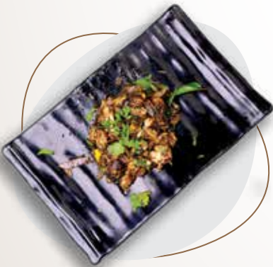
MUTTON BHEJA FRY ₹ 189