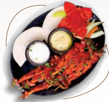
DAJAJ FAA ₹ 359