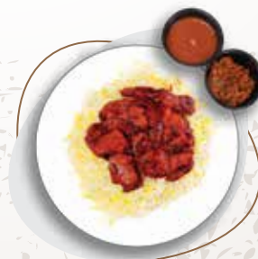
KOZI LAHAM ₹ 299