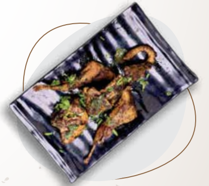
KAADAE FRY (TEETAR) FRY ₹ 189