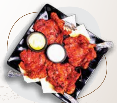
AHMEDIA SPECIAL B.B.Q (HALF ₹ 249 | FULL ₹ 459)