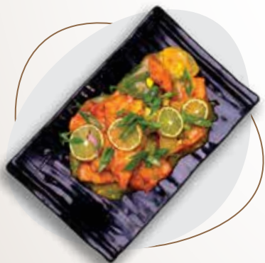
LEMON CHICKEN ₹ 259