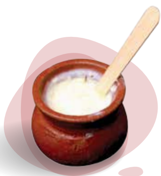
MATKA PHIRNI A ₹ 69