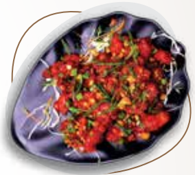
BABY CORN HOT GARLIC