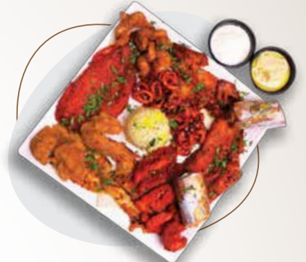
AHMEDIA SPECIAL PLATTER A (HALF ₹ 949)

Spice up your B.B.Q game with platter B.B.Q Chicken | Egyptian B.B.Q Alfaham B.B.Q | Pepper B.B.Q Afghani B.B.Q & Green pepper B.B.Q