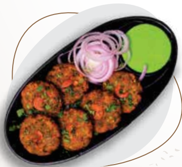
VEG HARA BHARA KEBAB ₹ 239