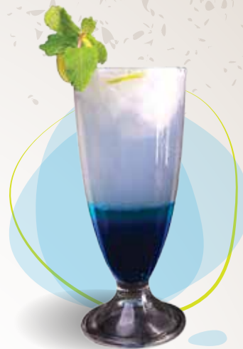
BLUE ANGELJUICE ₹ 119