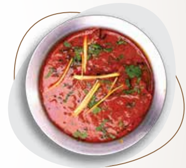
MUTTON HANDI ₹ 329