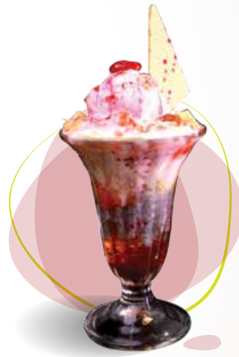
MINI FALOODA ₹ 139