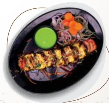
PANEER LAHORI TIKKI ₹ 259