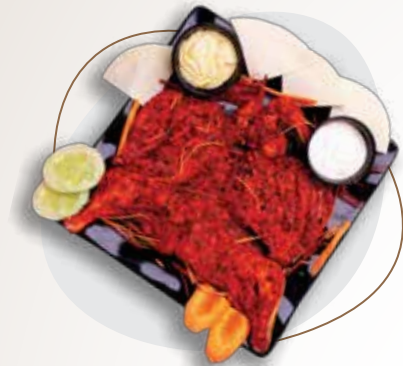
B.B.Q CHICKEN (HALF ₹ 239 | FULL ₹ 449)