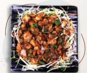
MUSHROOM SALT & PEPPER