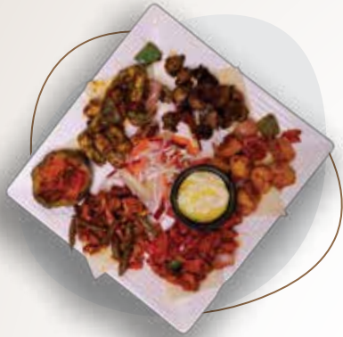
VEG PLATTER (HALF ₹ 499 | FULL ₹ 999)

Yummiest Tawa Veg Starters on a single platter Grill Mushroom | Grill Baby Corn Grill Paneer & Mix Veg