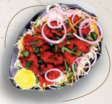
CHICKEN 65 BONELESS ₹ 230