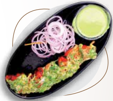
SHOLAY KEBAB ₹ 259 A