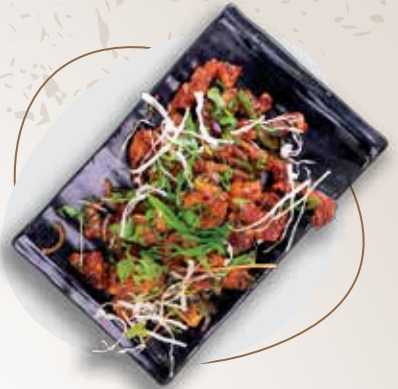
CRISPY CHILLI LAMB (DRY) ₹ 379