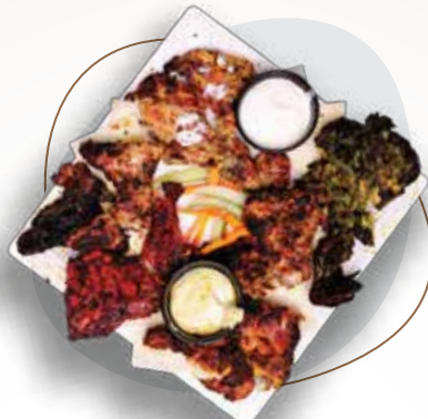
B.B.Q PLATTER ₹ 699

Yummiest Tawa Veg Starters on a single platter Grill Mushroom | Grill Baby Corn Grill Paneer & Mix Veg