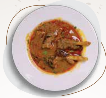
MUTTON PAYA (ATUKAAL) ₹ 199