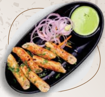
CHICKEN SEEKH KEBAB ₹ 279