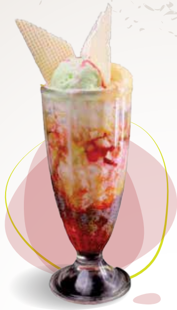
AHMEDIA SPECIAL FALOODA A ₹ 220