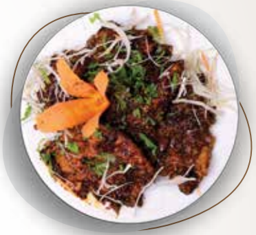
PHUKET FISH (DRY) ₹ 379