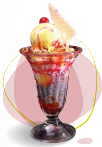
ROYAL FALOODA ₹ 165