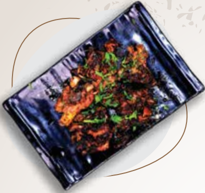
MUTTON SUKKA ₹ 209