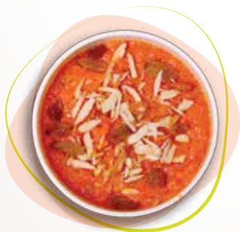
CARROT HALWA ₹ 129