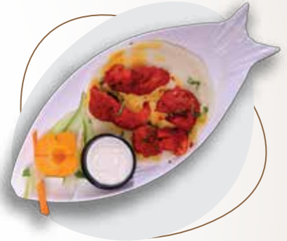
TAWA PRAWNS ₹ 399