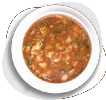
MANCHOW SOUP (VEG ₹ 109 | CHICKEN ₹ 119)