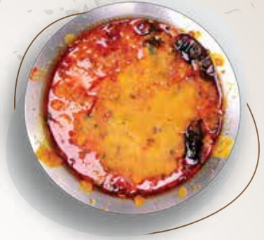
DAL TADKA ₹ 139