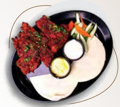
LAHAM TAWA RIBS (3pcs) A ₹ 399