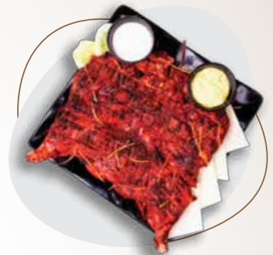
EGYPTIAN B.B.Q (HALF ₹ 239 | FULL ₹ 449)