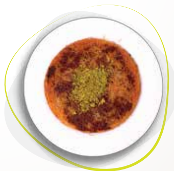
NUTELLA KUNAFI ₹ 320