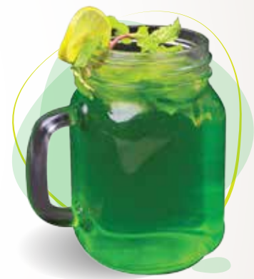
GREENAPPLE MOJITO ₹ 139