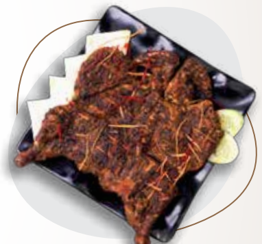
PEPPER B.B.Q (HALF ₹ 239 | FULL ₹ 449)