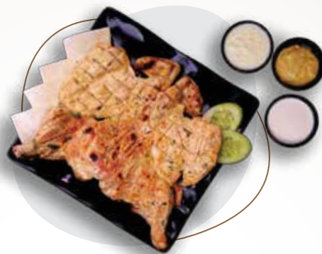
AFGHANI B.B.Q (HALF ₹ 239 | FULL ₹ 449)