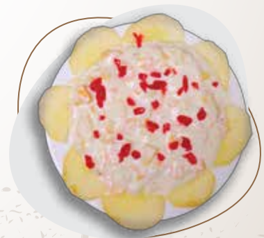
MIX FRUIT RAITA ₹ 100