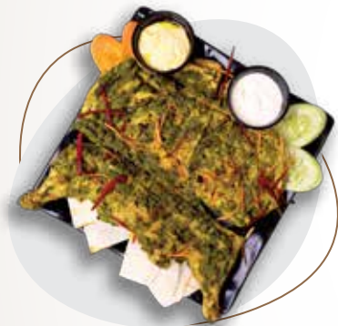
GREEN PEPPER B.B.Q (HALF ₹ 239 | FULL ₹ 449)