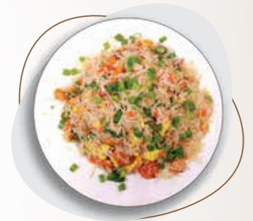
CHICKEN FRIED RICE ₹ 179