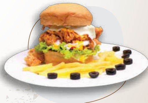
CLASSIC CRISPY BURGER ₹ 129