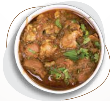
MUTTON KIDNEY FRY ₹ 199