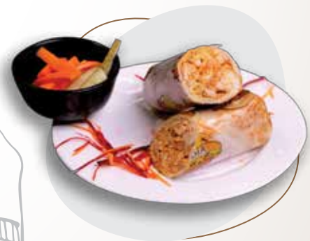
SHAWARMA ROLL ₹ 90