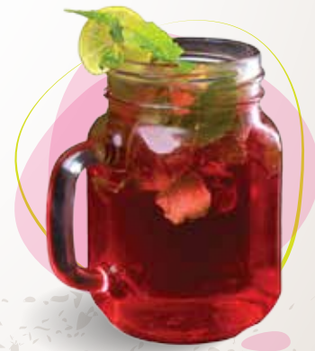
STRAWBERRY MOJITO ₹ 139