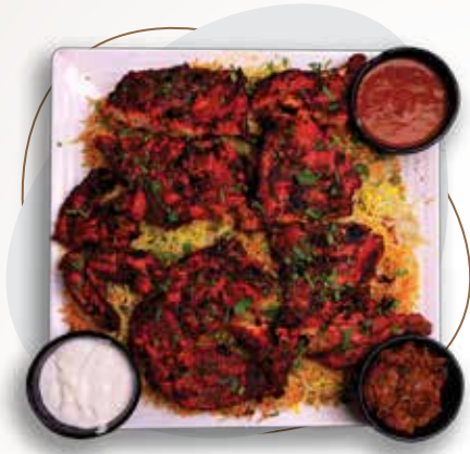
BBQ BIRYANI (HALF ₹ 449 | FULL ₹ 899)