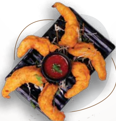
GOLDEN PRAWN (DRY) ₹ 349